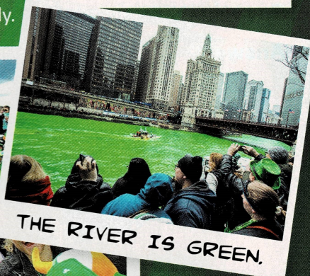
THE RIVER IS GREEN.